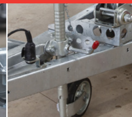
Heavy duty jockey wheel