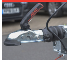
50mm ball coupling head