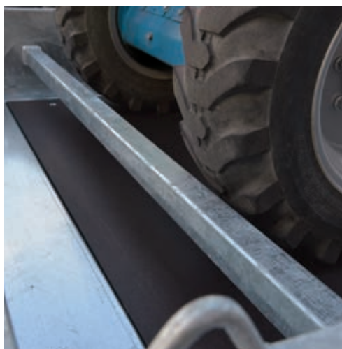
○ Machine stop bar Set up to provide consistent load positioning.