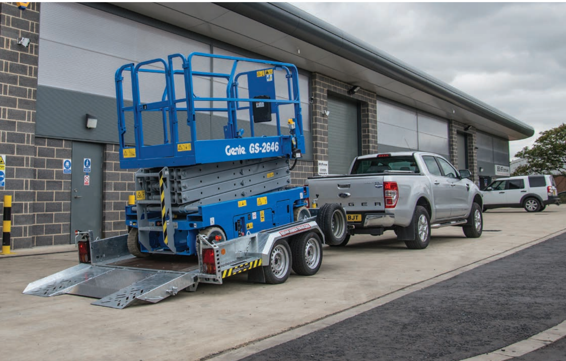
CARGO ALL PLANT TILTBED.