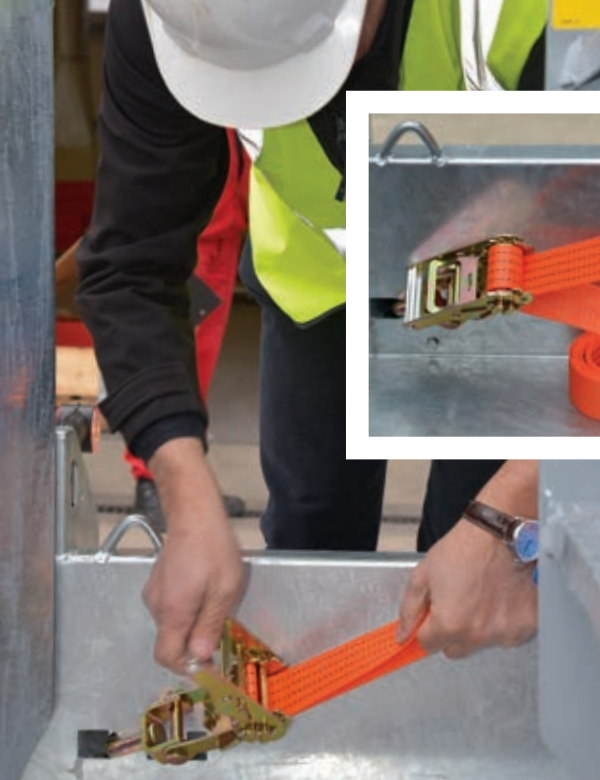
○ Tie-down straps heavy duty, set of 4 for easy and secure fastening of machinery.